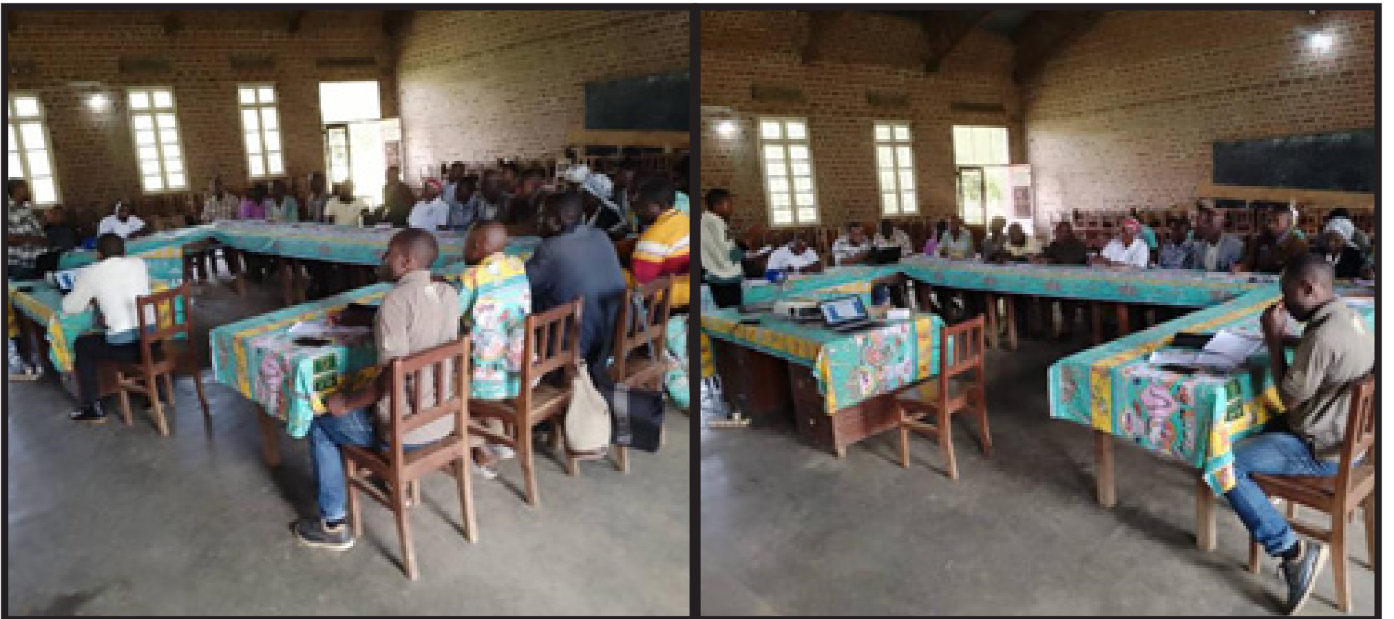
Restitution meeting of studies done in Mighobwe