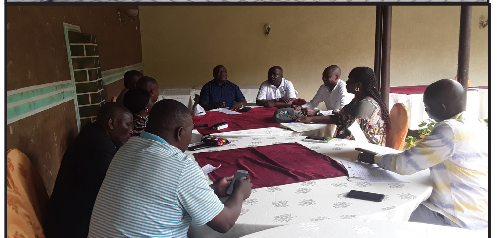
Advocacy mission in Goma/SG/MINADER