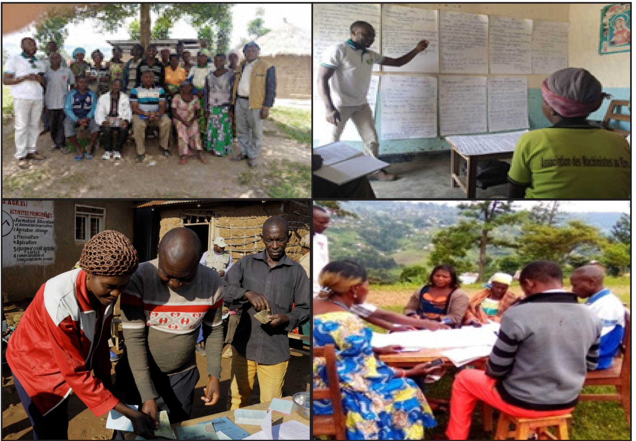
AVEC in Kabasha, Mighobwe, Luofu, Kipese