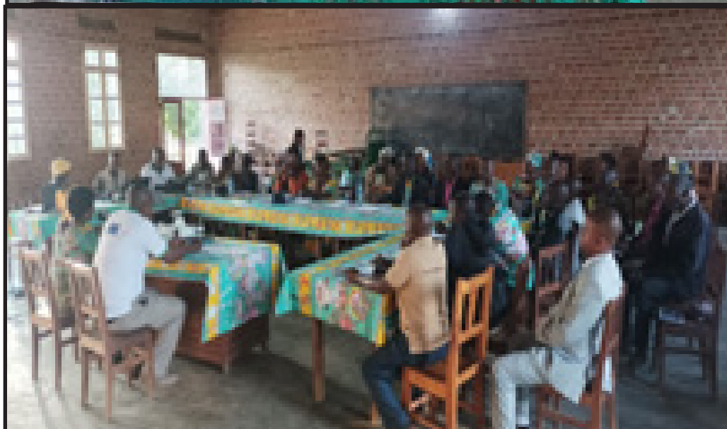
Business meeting held in Mighobwe