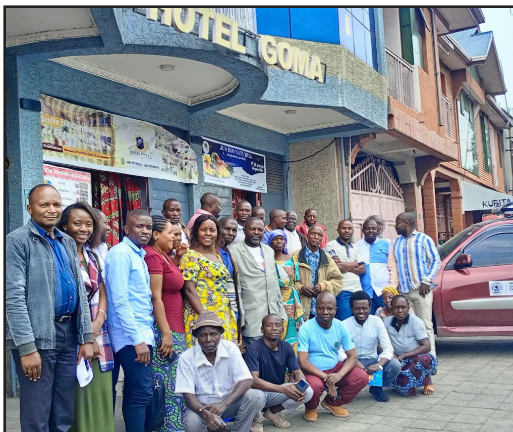
Business meeting held in Goma