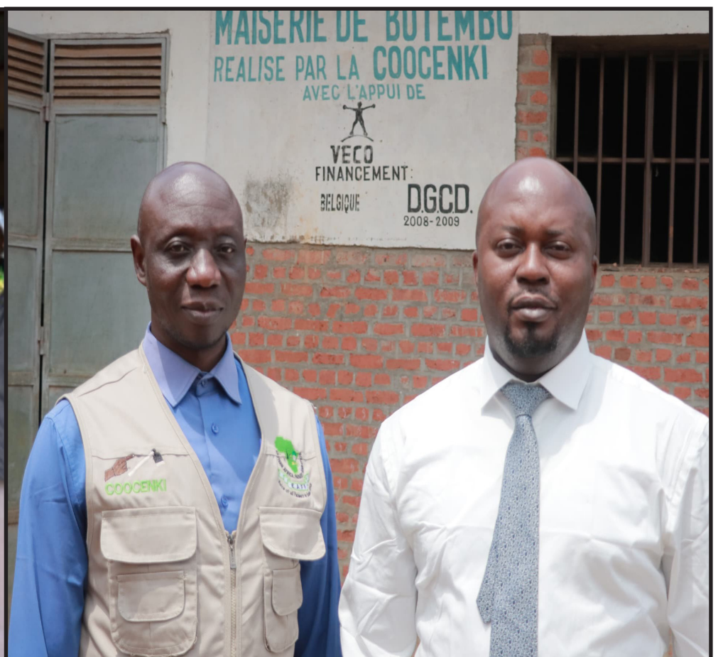
Director COOCENKI and Manager Equity BCDC, Agency-Butembo