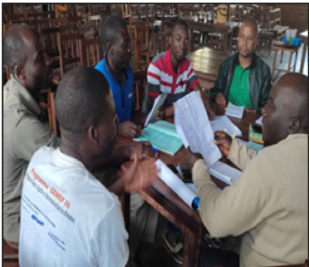
C.S/COOCENKI Members Training