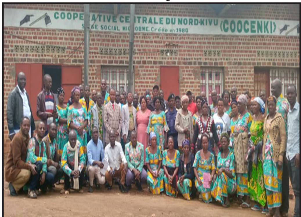
Participants in the 41st AGO-COOCENKI