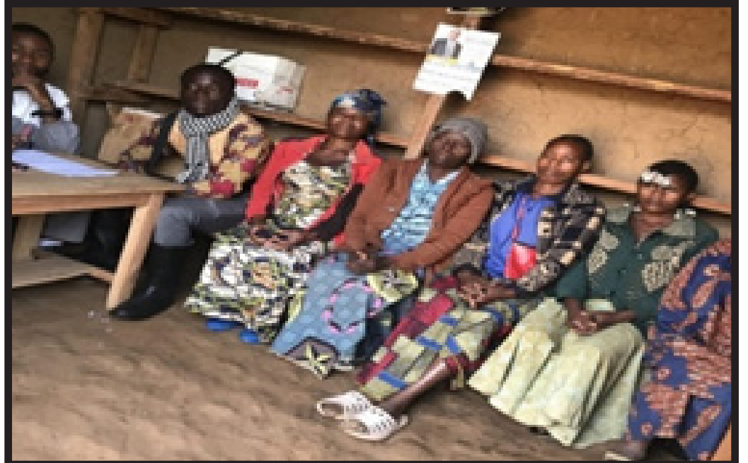
Working sessions at COOPAKI-Kayna