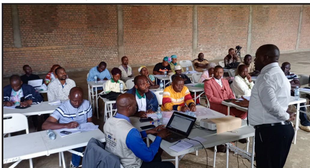
Business meeting held in Butembo