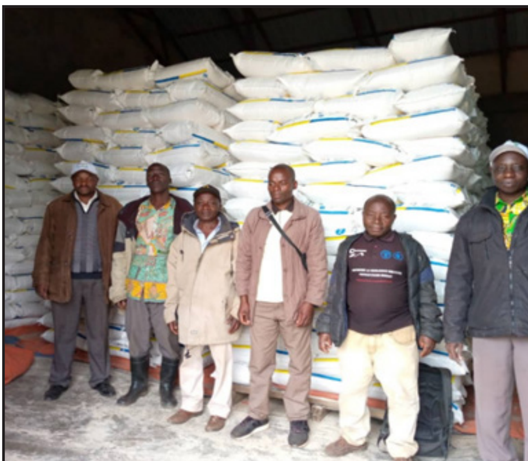
Business meeting with the HALINUNGA Establishment in Musienene