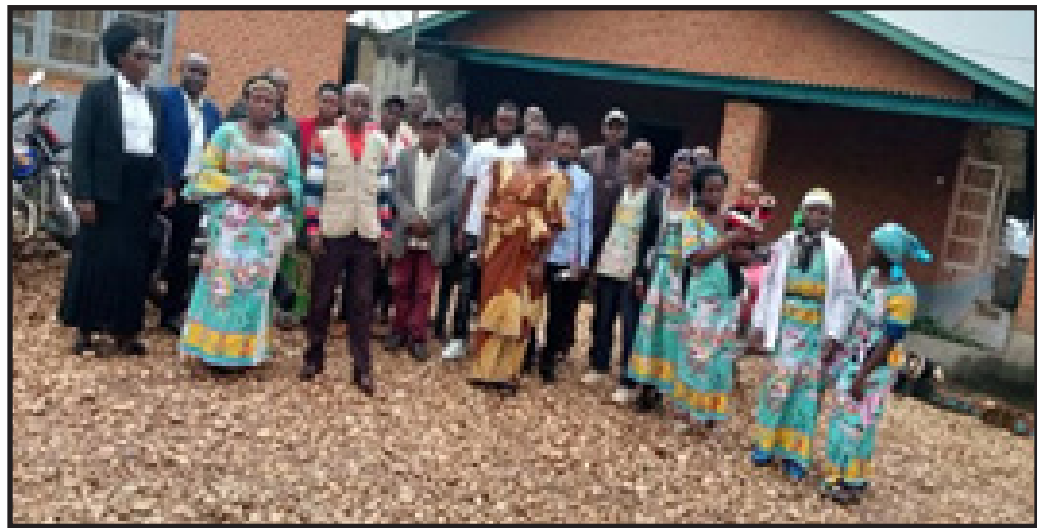
OHADA law training

Cooperative members, leaders and staff of COOCENKI benefited from training on the following themes: