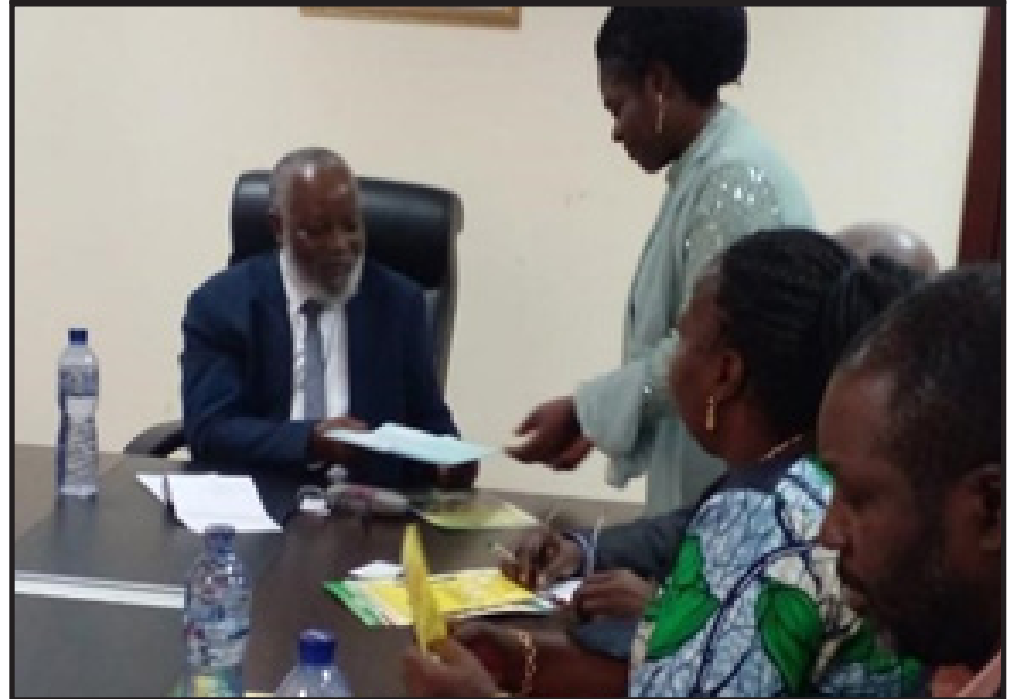
EAFF advocacy mission in KINSHASA